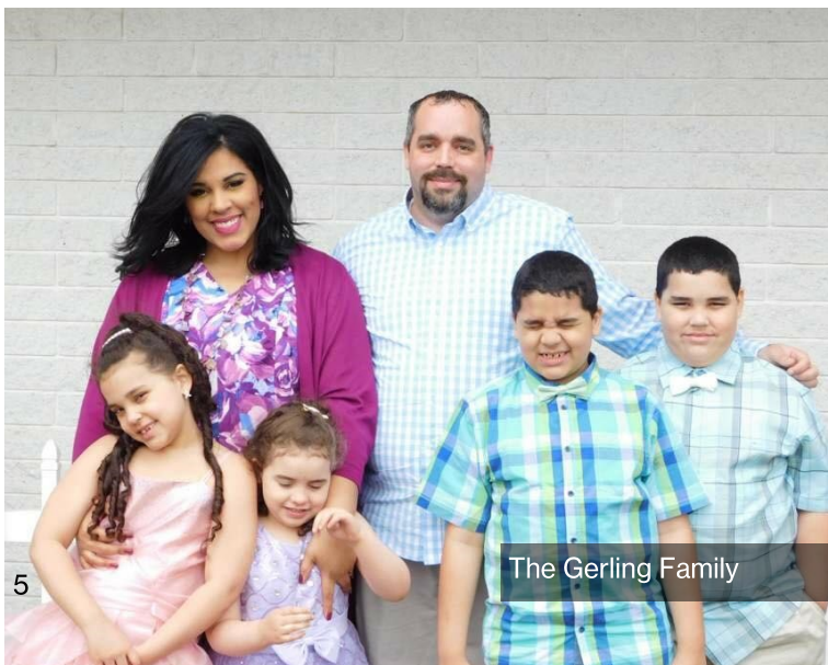
The Gerling Family

If you would like to learn more about Sugar Blush Bakery, please visit www.sugarblushbakery.com .